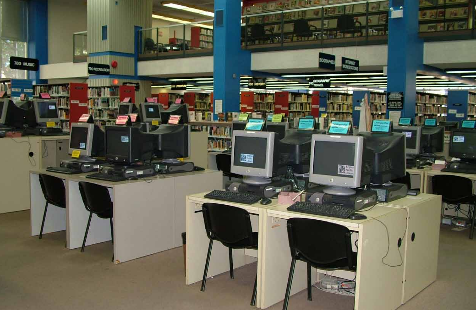
Central Library, located in downtown Regina, represents the heart of Regina Public Library.